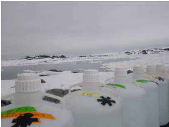
50L carboys waiting to be filled for the final DOM experiment.

Early December saw the completion of the second sea ice experiment. This experiment utilized sea ice with visible microbial growth in 50L carboys to examine the effects of sea ice on the microbial communities in seawater. This experiment lasted eight days to mimic the experiment conducted earlier in the season.