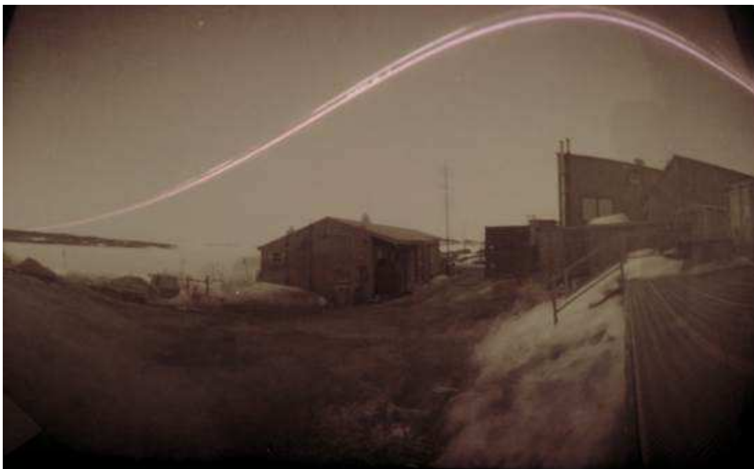
nine day exposure

Pleased with the results from the pinhole cameras, I dedicated the first few days of the month to making and setting out eight new cameras. Bringing the total number of pinhole cameras to twenty-three. Exposure times from station cameras ranged from two to forty-five days. A camera left on the L.M. Gould from October 27 to December 20 (first and last day of my deployment) served as the longest exposure at fifty-five days. In all, I ended up with seventy-seven exposures during my eight weeks of deployment.