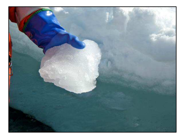
Scientists searching for visible microbial growth in the ice (no visible microbial growth).

Sampling at Station B remains elusive as the sea ice continues to prevent us from boating. However, we are optimistic that the warming weather in October will provide us with the opportunity to return to boating on a weekly basis. Our team continues to sample the Sea Water Intake on a weekly basis and we are finalizing our preparations for our next carboy experiment. On that note, we continue to search for sea ice with visible microbial growth along the shores of Arthur Harbor. We intend to utilize this sea ice for the 3<sup>rd</sup> carboy experiment designed to look at the effects of sea ice on microbial community development.