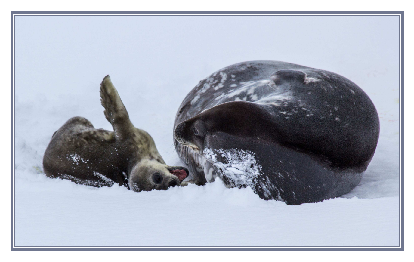
A Weddell seal and her pup on the ice in Hero Inlet.