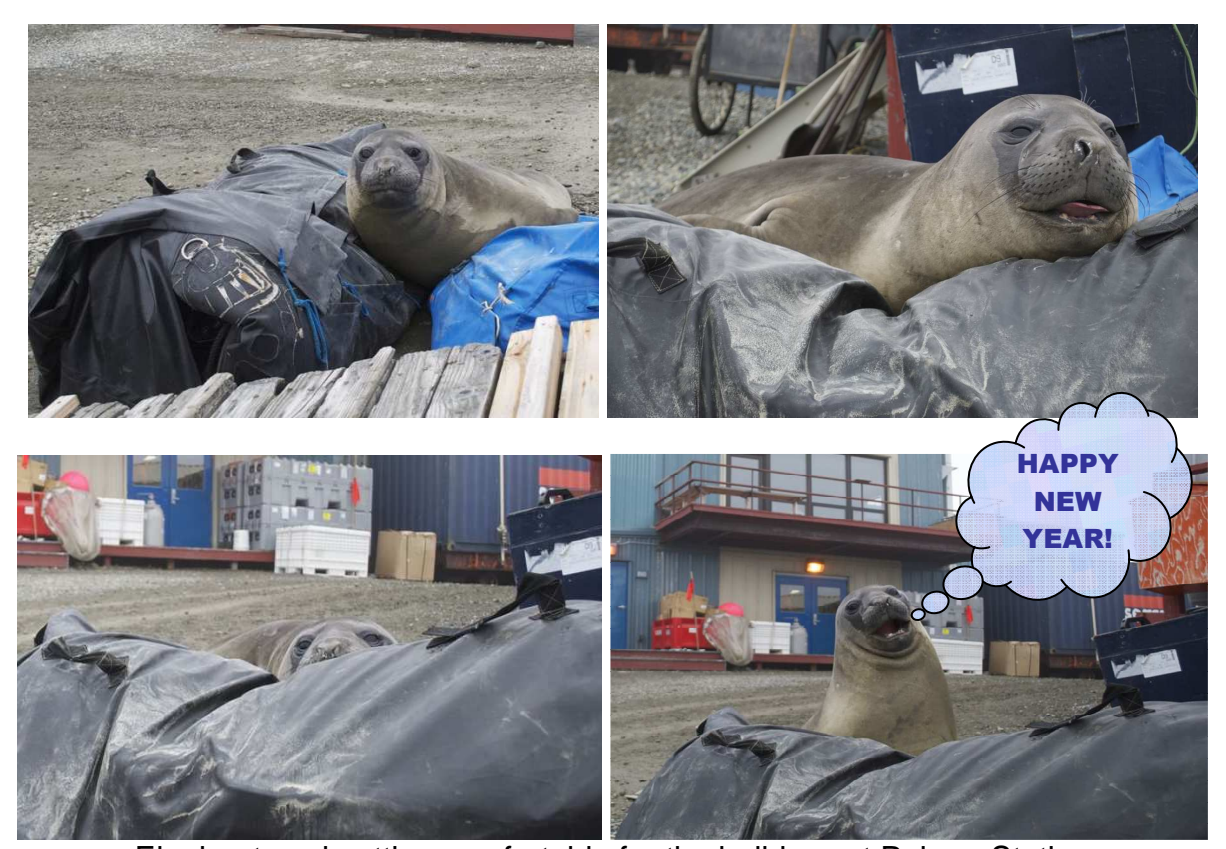
Elephant seal getting comfortable for the holidays at Palmer Station