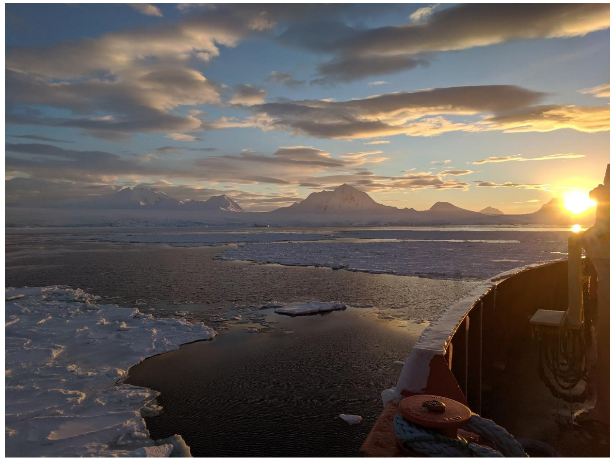
Approaching Palmer Station aboard the ARSV Laurence M. Gould.