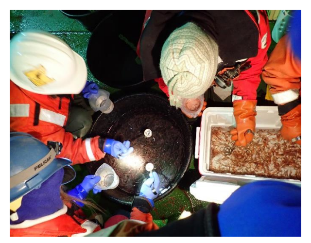
Figure 1. Picking out individual healthy juvenile krill using stainless steel sauce ladles.

Our research began during the transit south on the R / V Laurence M. Gould. During the nights of April 17 and 18, we searched for and successfully collected ~5,000 juvenile Antarctic krill from the Croker Passage and Wilhelmina Bay (Figure 1). We maintained the krill in two large Xactic tanks that were plumbed with natural seawater. On April 21, we arrived at Palmer Station and the two Xactic tanks were immediately transferred via the Landing Craft to Palmer while the R / V Laurence M. Gould held station in Arthur Harbor. Despite this being a new means of transfer, it went off without a hitch and we are very grateful to everyone, both ship- and shore-side, who helped make this happen.