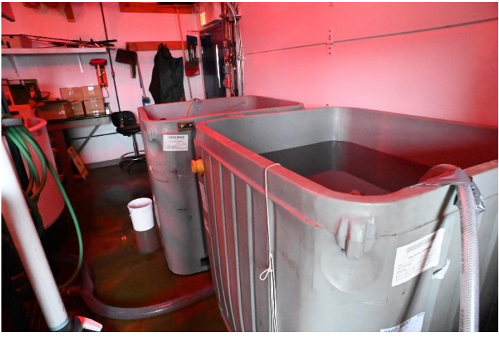
Figure 2. Xactic tanks with krill in the Palmer Aquarium Room.

The Xactic tanks were quickly plumbed into the Palmer Station natural seawater (Figure 2) and the krill were assessed and found to be in good condition.