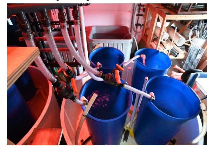
Figure 3. One set of four 200-L tanks set up inside a large circular aquarium tank.

four smaller replicate tanks). This would minimize issues with inconsistent flow rates between many tanks, would reduce the chances of overflow, would also reduce the chances of the water freezing in the tanks, and would allow us to use many more krill (~660 instead of 60). Since Antarctic krill are a pelagic schooling species, it also made more sense to have them in larger volumes of seawater. In order to take replicate samples of krill from each tank, we must be able to prove that the environmental conditions in each treatment tank are not significantly different. We have been recording the seawater temperature, salinity and dissolved oxygen in each tank, twice a day, and are not seeing any significant differences, giving us confidence that this is the best approach for our study.