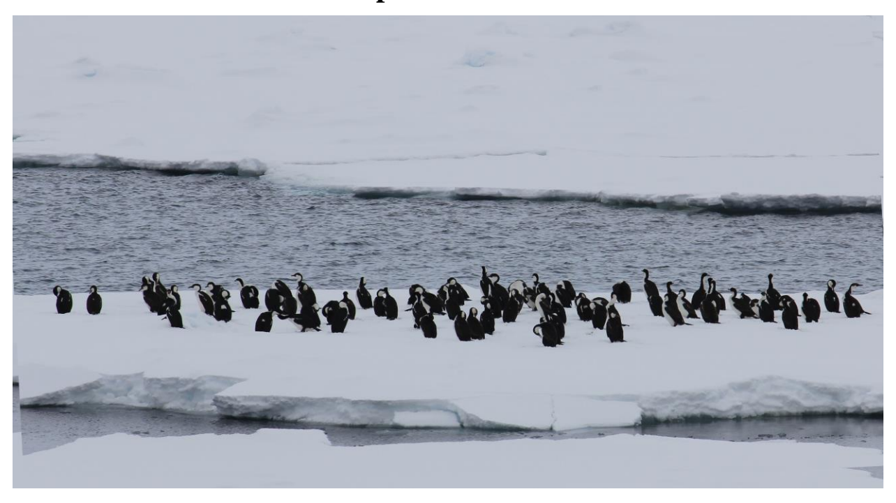
Cormorants returning to Palmer in droves.