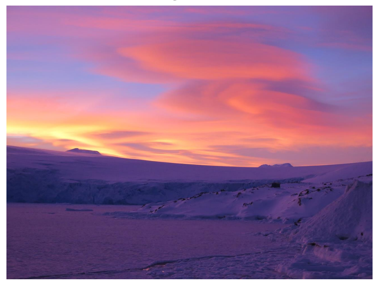
Sunrise over an ice covered Arthur Harbor.