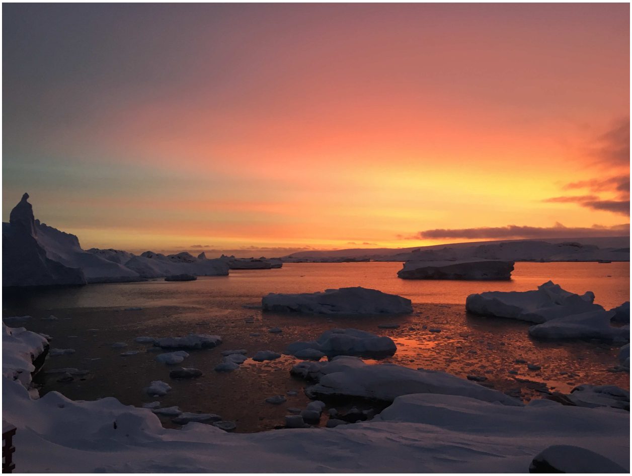
Sunset lit icebergs in Arthur Harbor.