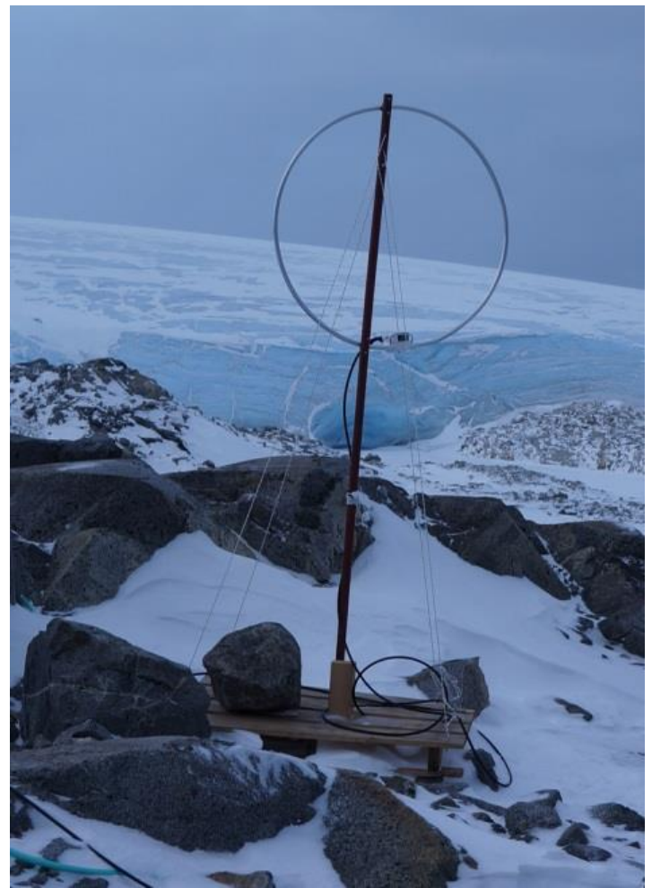
Figure 3. HF receive antenna installed behind Terra Lab building.

A receive HF loop antenna has been installed in a Palmer station "backyard" directly behind Terra Lab as shown in Figure 3.