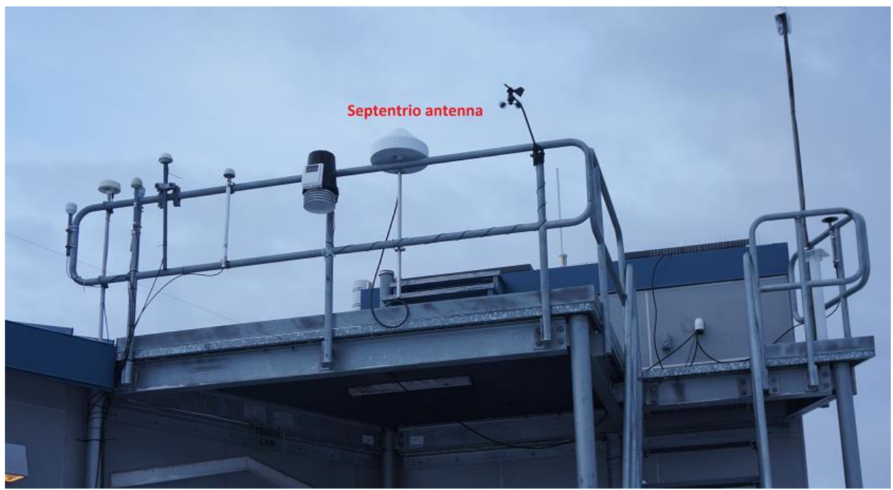
Figure 1. GPS antenna installation on the roof of the Terra Lab building.