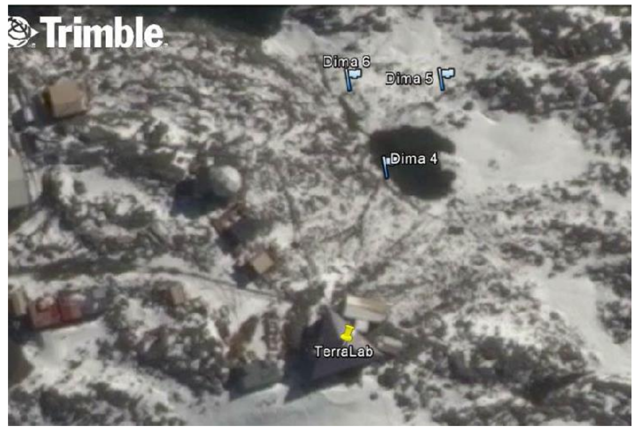
Figure 5. Locations for the upcoming three receive antennas to be installed in October (blue flags).