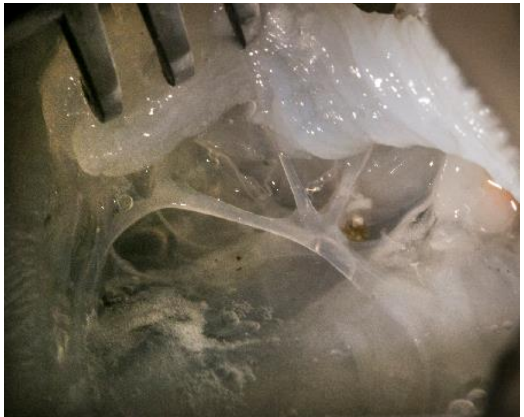
Branchial arteries in C. aceratus

Dr. Stuart Egginton (University of Leeds) completed the work in which the in situ heart preparation is used to quantify maximum cardiac power output in both ambient and warm-acclimated notothenioids exposed to a range of temperatures. Our results indicate that the red-blooded Notothenia coriiceps is able to sustain cardiac work with both acute and chronic warming, with a greater stability than either of the two icefish species under investigation, the white-hearted (-Mb) Chaenocephalus aceratus , and the red-hearted (+Mb) Chionodraco rastrospinosus . While C. aceratus hearts failed with only a short duration exposure to warm temperatures, cardiac output was maintained after warm-acclimation in hearts of C. rastrospinusus . Accompanying the higher sensitivity of icefish hearts to afterload, we have demonstrated a similar ability of branchial and hypobranchial vessels (photos below) to generate force (i.e., vascular tone) in C. aceratus and N. coriiceps , as befits their genetic relatedness, while vascular reactivity in C. aceratus is generated by a reduced set of agonists with significantly lower efficacy.