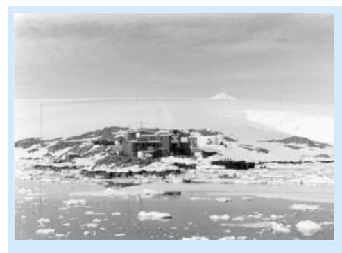
Palmer Station Antarctica

The expedition planning typically begins in April, less than one month after returning from Antarctica at the conclusion of the previous field season. Personnel lists are prepared well in advance of deployment to Antarctica because of the medical and dental exams that are required to ensure our team's ability to withstand the rigors of high latitude field work. Detailed lists of supplies and chemicals needed to conduct our field programs must also be prepared, reviewed and ordered. There are no hardware stores or chemical supply houses on the frozen continent. In June, the PAL principal investigators meet to plan the detailed sampling and shipboard experimental protocols and to make a final decision on selection of the expedition Chief Scientist. Throughout the summer, plans are finalized. By fall, all participating scientists are physically qualified and we begin to make our final travel plans, including important issues such as the arrangement of dog-sitters, bill-payers and the other essentials of life that simply must continue in our absence. Some of the PAL scientists deploy for Antarctica as early as October to begin field work at land-based Palmer Station ahead of the annual cruise. These scientists typically remain in the field 1 * 1 .*