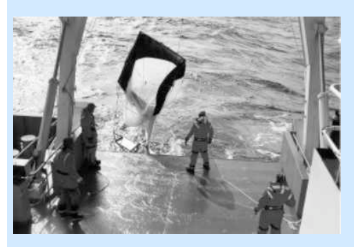
Sampling for krill with plankton net on research vessel Laurence M. Gould