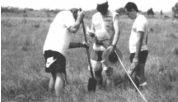
Figure 4. Collecting sediment cores in a salt marsh impoundment at Merritt Island National Wildlife Refuge, FL. Impoundments provide the opportunity to manipulate hydroperiods.

only population trends by species, but also how colony nesting site and feeding distributions will change with incremental changes in relative sea level. Model results can then be tested in a number of other estuaries along the Atlantic and Gulf coasts to see how generalizable the pattern appears to be.