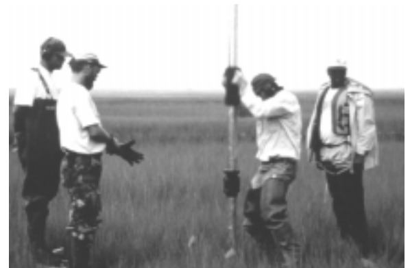
Figure 2. Installing Sedimentation Erosion Table pipe in Spartina patens at Nauset Marsh, Wellfleet, Cape Cod National Seashore MA.